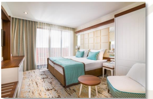
Double room Side sea view