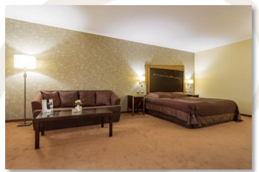
Double Superior room