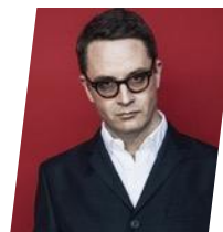
Nicolas Winding Refn